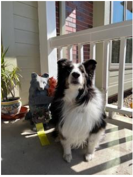
Shadow earned his RE at the Lincoln Trial October 2024.