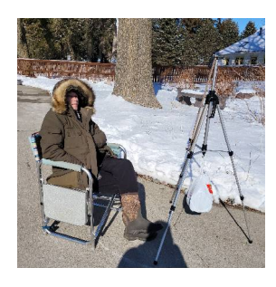
True meaning of cold steward