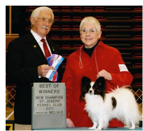
Chanel earned her championship in February of 2011. She fulfilled my lifelong dream of showing a dog to a championship!