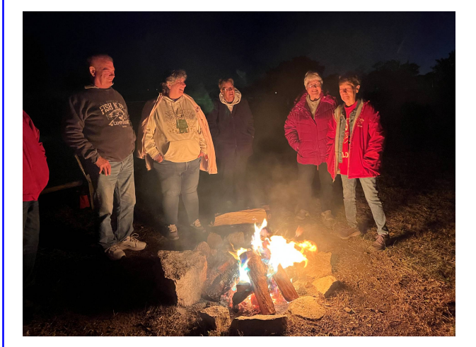
Fun around the bonfire