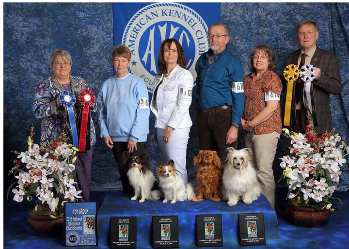
Toy Dog Winners