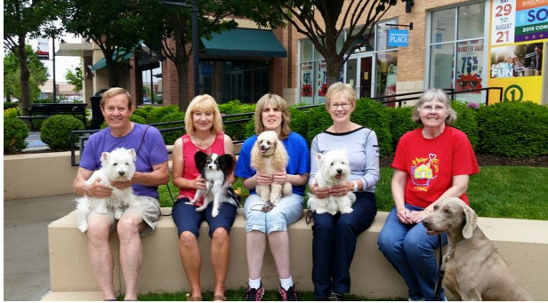
Canine Good Citizen Urban June 25, 2015